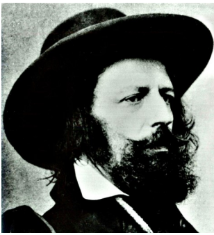
Alfred Lord Tennyson