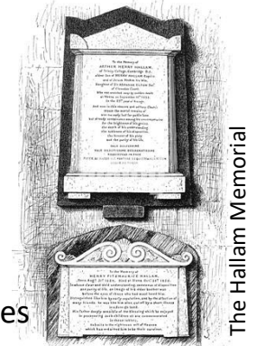
The Hallam Memorial

Clevedon Civic Society is celebrating its 50th anniversary.